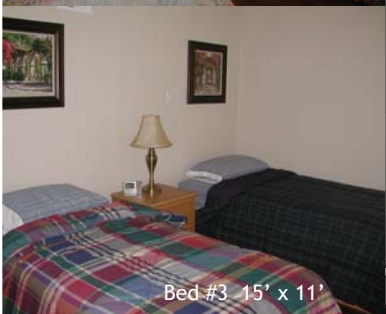
Bed #3 15' x 11'

Our objective is to meet the needs of all residents, including physical, emotional, and social. We will provide a continuity of care and recognize the need for dignity, self-esteem, and above all the desire in all of us to feel loved.