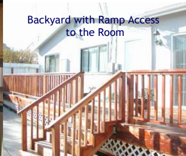
Backyard with Ramp Access to the Room