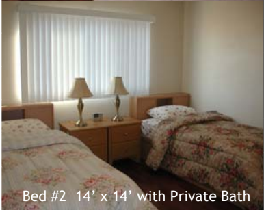
Bed #2 14' x 14' with Private Bath

Our Mission is to provide the entire realm of assisted living to our residents. Our care and personal attention to each individual's particular needs will result in improvement in your loved one's quality of life.